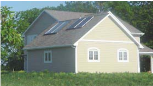
Photograph 2 , The Bircher home in De Pere, WI includes two small PV panels (right) mounted over shingles, total capacity 550 watts, as well as two solar water-heating panels (left). The PV system meets roughly 15% of the home's electricity needs.

A rack-mounted PV system can be installed on any type of roof, but installation costs will vary. Typically, composition shingles are easiest to work with, and slate is the most difficult. In any case, an experienced PV provider will know how to work on all roof types and can use roofing techniques that eliminate the possibility of leaks. Ask your PV provider how the PV system affects your roof warranty.