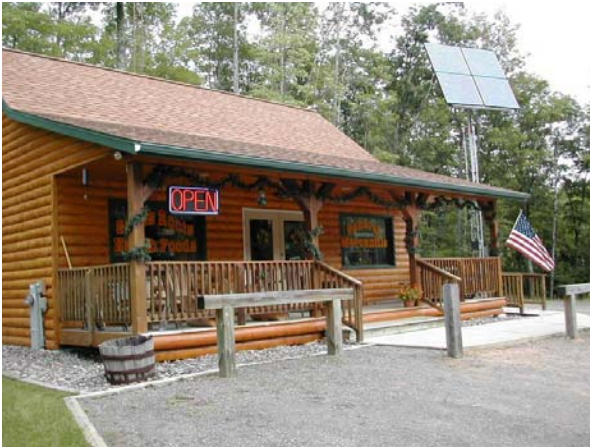
Photograph 4. Grass Roots Health Food Store, Eagle River WI. Includes a 0.5 kW dual axis tracking PV system. (Typically systems are mounted on shorter poles.)

PV systems that are not connected to the electric provider's distribution grid will require batteries to supply a reliable source of power. The size of the battery bank depends on the electricity needs of the site and the days of storage the owner desires (three to seven days is common). Battery-based systems will require a charge controller and battery box. Quite often, a gasoline, diesel or propane generator (to help maintain batteries and support the site during prolonged periods of low sun) is included in off grid systems. Batteries require some maintenance and if treated well will last four to seven years.