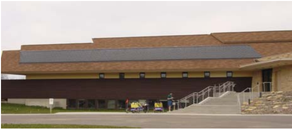
Photograph 3 , The University of Wisconsin – Madison, Madison, WI. This 8.5 kW system uses PV modules laminated onto 700 man-made roofing slates.

Solar electric roofing panels also serve as roofing materials, providing the customary weather protection standard roofing materials provide. These panels are available as shingles (cover photograph), standing seam metal roofing (photograph 1) and slate roofing (photograph 3). Of the three, the most economical is field-laminated standing seam metal roofing. Solar electric roofing will cost 0% to 40% more than rack-mounted PV panels.