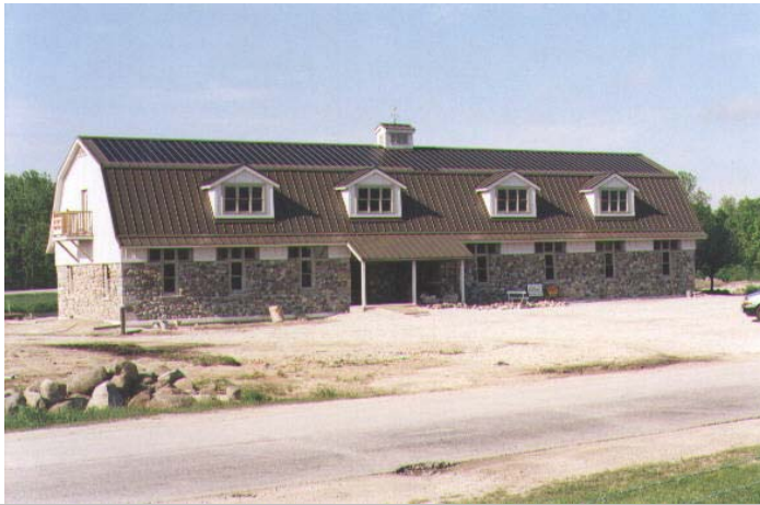
Photograph 1. The Ritger Law Office, Random Lake, WI has a 5.12 kW solar electric system composed of thin film panels laminated onto the standing seam metal roof. Note the darker colored PV panels installed on the upper gable of the roof. The office also employs daylighting, a geothermal heat pump system and in-floor radiant heating.